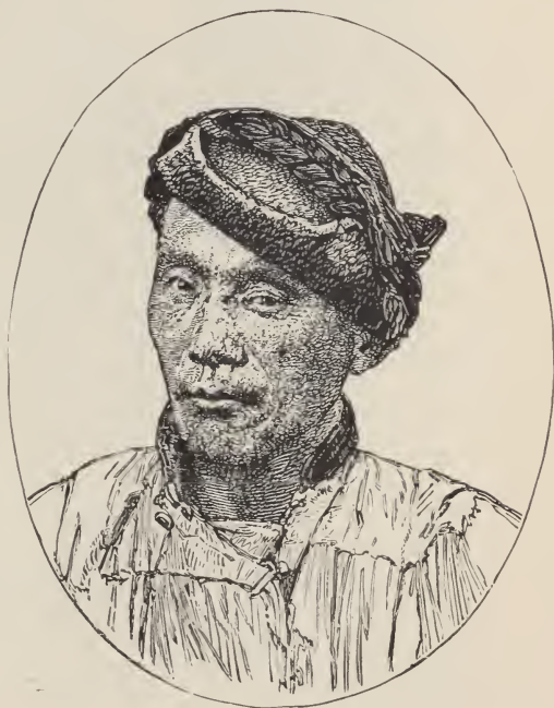
A CHINESE COOLIE.